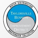
Annual Combined Water & Sewer Bill - 2017